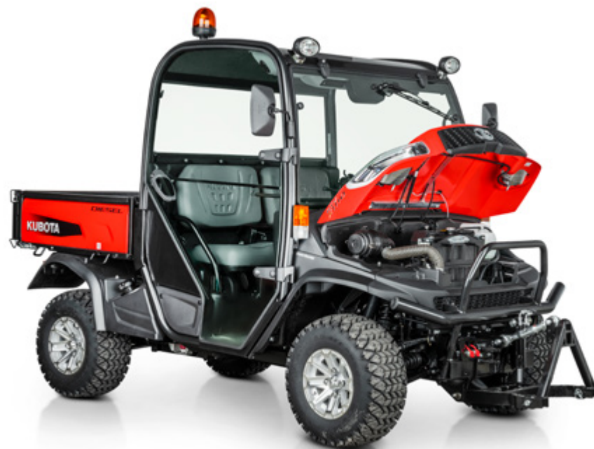
Front-linkage not available in the UK