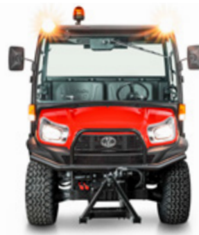
Front-linkage not available in the UK

The machines can be equipped with a front power lift with 500 kg lifting capacity and double-acting hydraulic valve as an optional extra. In addition, you can choose to specify a front cable winch with a pulling force of 1,800 kg. This allows you to literally get things moving.