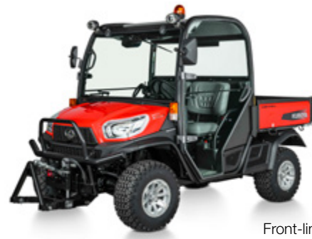
Front-linkage not available in the UK

To enable you to use the RTV X-1110 in the dark, optional work lights are available for the front and rear. This means you can keep everything fully under control, even at night.